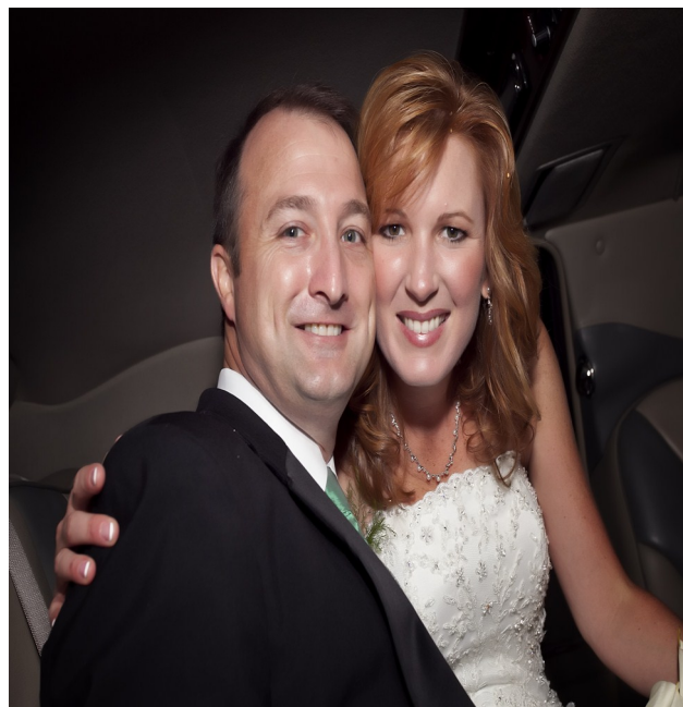
She is such a beautiful bride !!!!

Why I joined IAAP—I like being a member of IAAP because it allows me to learn more about my profession, gives me the opportunity to network with others, and shows my boss my commitment to my profession.